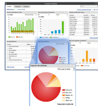
Images shown for example only. Logo and Company Snapshot can be customised to your business.